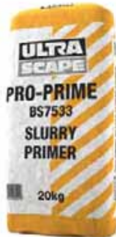
ProPrime Slurry Primer