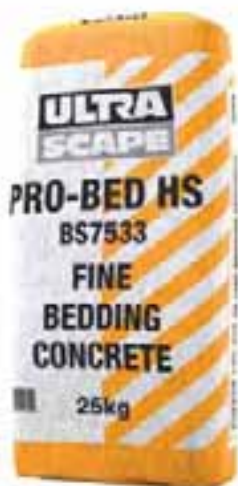
ProBed HS Fine Bedding Concrete

The Emtek Ultrascape System comprises of: