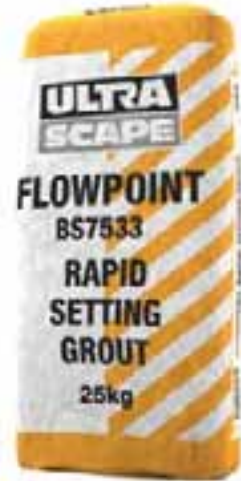
Flowpoint Flowable Grout